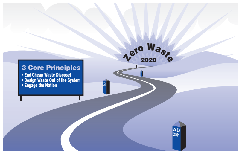
THE ROAD TO ZERO WASTE

Rapid and accurate monitoring systems will be required to assess what waste is being produced, its composition and its source. This information needs to be fed back to the waste producer and to the community at large in a feedback loop. Feedback on the achievement of intermediate targets also needs to be made highly visible - at both local and national level.