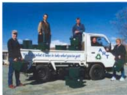
Ahuriri Resource Trust Team

The Ahuriri Resource Trust (ART) was established in March 2000 and began a kerbside pick-up service in September 2000 for the townships of Omarama, Otematata and Kurow. Through the Annual Plan process the ART model has been adopted as a Pilot Project for the Waitaki District Council (WDC), a Zero Waste Council.