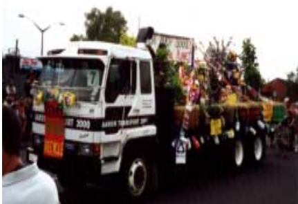
Maraetai School Float

For further information on the school's Zero Waste achievements contact Duclie Bignell on 09 536 6570 or maraetai@ihug.co.nz